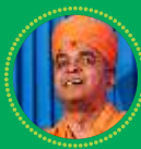
BRAHMAVIHARI SWAMI MOTIVATIONAL SPEAKER

A global thought leader on leadership, ethics and personal excellence, Shiv Khera inspires action through his iconic message that winners don't do different things; they do things differently.