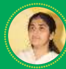
SISTER SHIVANI MOTIVATIONAL SPEAKER